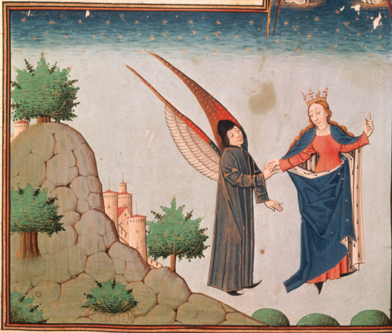
"The Flight of the Soul" from Boethius's De consolacione philosophiae.